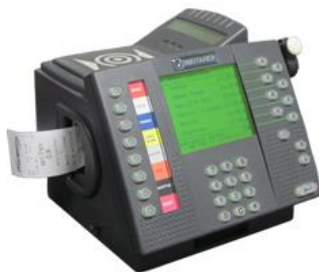
Wayfarer TGX 150

eBus Supplies was awarded the contract to replace the aged system, refurbish and relocate their old Wayfarer ticket machines to other depots of the group.