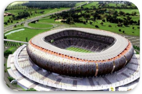
Soccer City Stadium, Johannesburg

Senior management of the group saw the benefits all round and awarded eBus Supplies the task of implementing the Parkeon Wayfarer system at a further 8 depots.